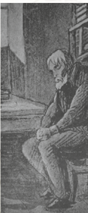
Lelewel in his study, author Aleksander Lesser, 1889 (VU Library, Manuscript Department, F.12-483) Lelewel's autograph (VU Library, Manuscript Department, F.12-159)